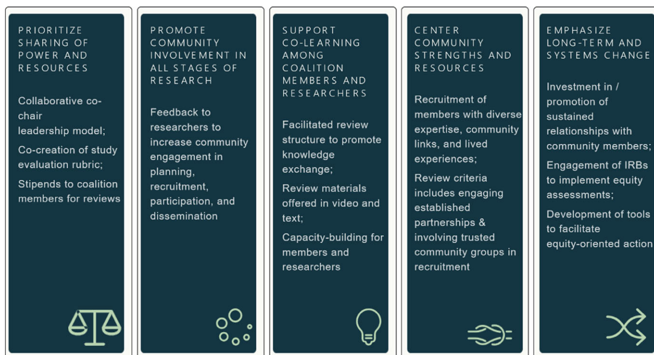
Fig. 1. Community-engaged research values aligned with core activities of the Community Coalition for Equity in Research.