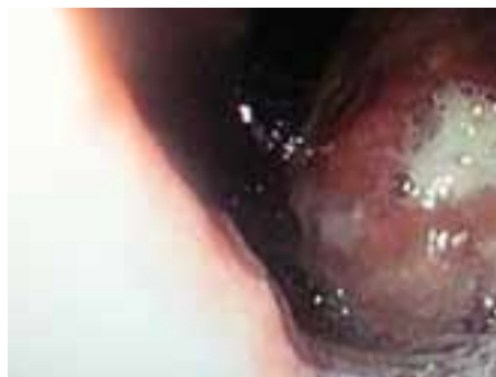
Fig.1: Endoscopic view

Macroscopic examination of the resected portion of the stomach showed partial gastrectomy as well as splenectomy specimens, the former one revealed a submucosal cream colored mass extending to serosa, 10 cm in the greatest diameter. Hilum of the spleen was also grossly infiltrated by the tumor. No lymph node was included in the specimen. Histopathological evaluation demonstrated eroded gastric mucosa which was underlined by a fascicular spindle cell growth with elongated vesicular nuclei, lacking obvious atypia, and eosinophilic cyto-