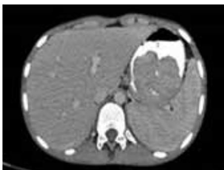
Fig.3: CT scan view