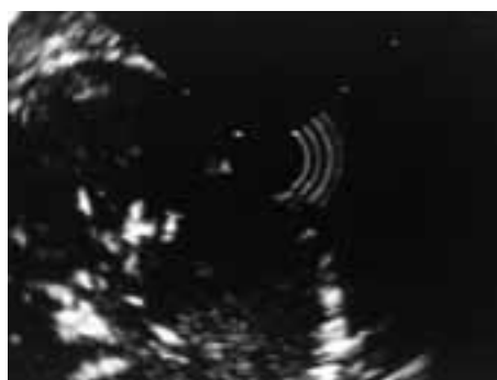
Fig.2: Endosonographic view