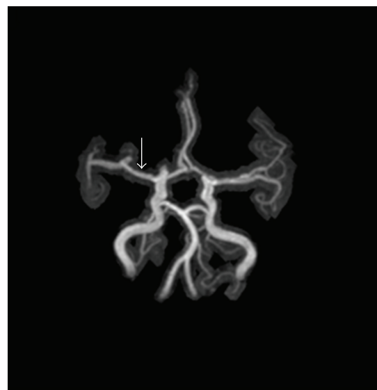
FIGURE 4: Sixteen months after thrombolytic therapy, MRA shows right middle cerebral artery recanalization (arrow).

A neurological examination showed a mild improvement, with NIHSS of 11 and mRS of 4, but no change in muscle power or facial palsy. Her transthoracic echocardiogram revealed a large ( 3 \times 4 cm) homogenous mass with a stalk attached to the left interventricular septum (Figure 1), but her carotid duplex ultrasonography was normal. A transcranial Doppler (TCD) exam showed a decrease in blood flow in the right middle cerebral artery. From T2 and diffusion-weighted magnetic resonance image (MRI), infarcts in right basal ganglion and temporal lobe were observed (Figure 2).