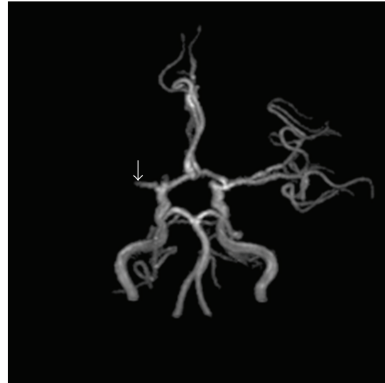
FIGURE 3: MRA shows right proximal middle cerebral artery (MCA) occlusion (arrow).