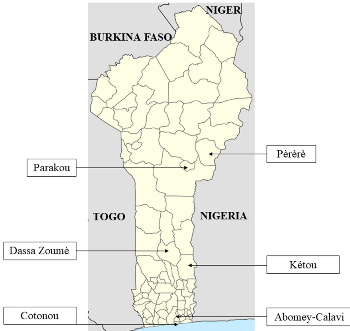
Fig. 1 A map of the Republic of Benin, showing the cities selected for the study

body height was obtained from their ID card information while their body weight was obtained using a mechanical scale, type SECA. Those with 18.5 \leq \text{Body Mass Index (BMI)} \leq 25 were classified as having a normal body weight while those with \text{BMI} > 25 were classified as being overweight or those with \text{BMI} > 30 as obese [16]. Those who smoked occasionally as well as those who smoked regularly were all considered as being tobacco users. We also recorded peoples' self perspectives on being regularly physically active or not. Those who were physically active were consecutively questioned about the weekly frequency and duration of their physical activity.