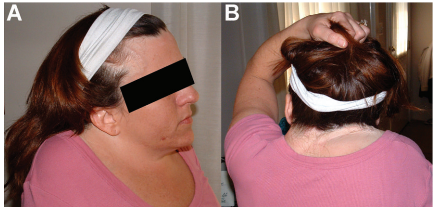
Figure 1. Photograph of patient with Klippel-Feil Syndrome. A-note webbed neck and decreased range of motion secondary to fusion of the cervical spine, B-note surgical scar further restricting range of motion.

In 1988, Burns et al. described an awake nasal fiberoptic intubation of a mother with Klippel-Feil Syndrome, increased intracranial pressure and severe pre-eclampsia who necessitated cesarean section at 33 weeks gestation. 4 Nasal fiberoptic intubation was difficult for that patient as they were not able to pass the tracheal tube over the bronchoscope and