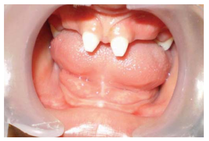
Fig. 3: Intraoral view showing partial anodontia of maxillary jaw with complete anodontia of mandibular jaw. Aplasia of alveolar bone in the edentulous areas is clearly seen