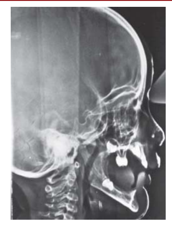
Fig. 5: Lateral cephalogram showing aplastic lower jaw

Removable partial denture for the upper arch and complete denture for the lower arch to restore function, followed by strip crown with composite restoration for conical-shaped deciduous maxillary centrals to give them proper shape and morphology was planned.