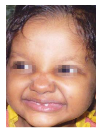
Fig. 1: Front view showing classical features of child with ectodermal dysplasia