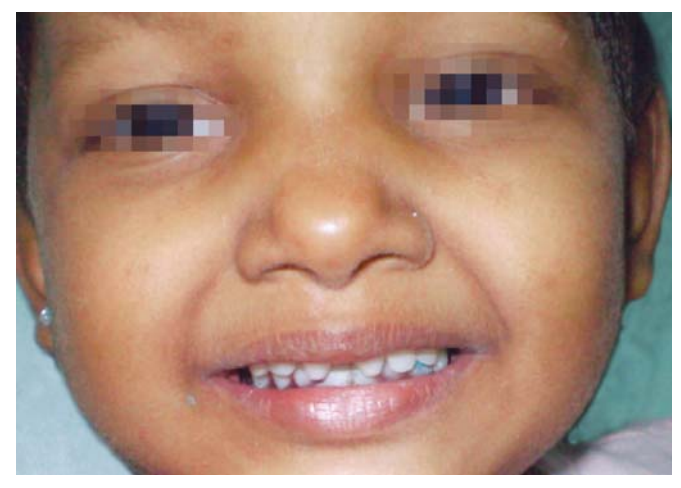
Fig. 6: Child patient with trial denture

Jaw relation was recorded. This recorded jaw relation was transferred on to mean value articulator. Teeth arrangement in lower and upper denture base was done. In the next appointment trial dentures were tried for retention, stability, function and esthetic (Fig. 6). Lower complete denture and upper removable partial denture was constructed with heat cure acrylic by conventional denture making procedure. Morphological modification of two conical-shaped upper deciduous central incisors with composite strip crowns was done to improve the esthetics (Fig. 7). Before delivering the dentures, topical fluoride application was done to maintain the teeth present in the upper arch.