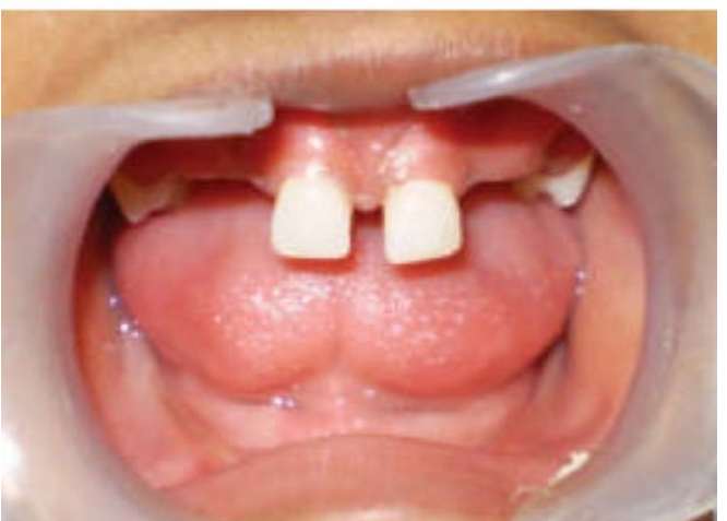
Fig. 7: Conical deciduous central incisors modified with strip crowns

Dentures were delivered (Fig. 8). Preoperative and postoperative comparison saw marked improvements in facial form and esthetics (Fig. 9). Instructions regarding maintenance of dentures were given and recall appointments were scheduled after 24 hours, 1 and 3 weeks. Fluoride mouthwash was prescribed. After 3 weeks the patient was well adjusted to the dentures. The parents were very happy and stated that there was a significant improvement in her speech and esthetics, and it has contributed toward her psychological well-being. She was scheduled for recall for every 3 months for evaluating her oral hygiene status and maintenance of dentures.