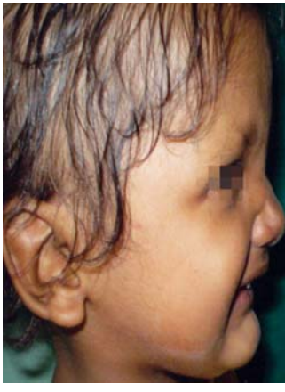
Fig. 2: Side view showing classical features of child with ectodermal dysplasia