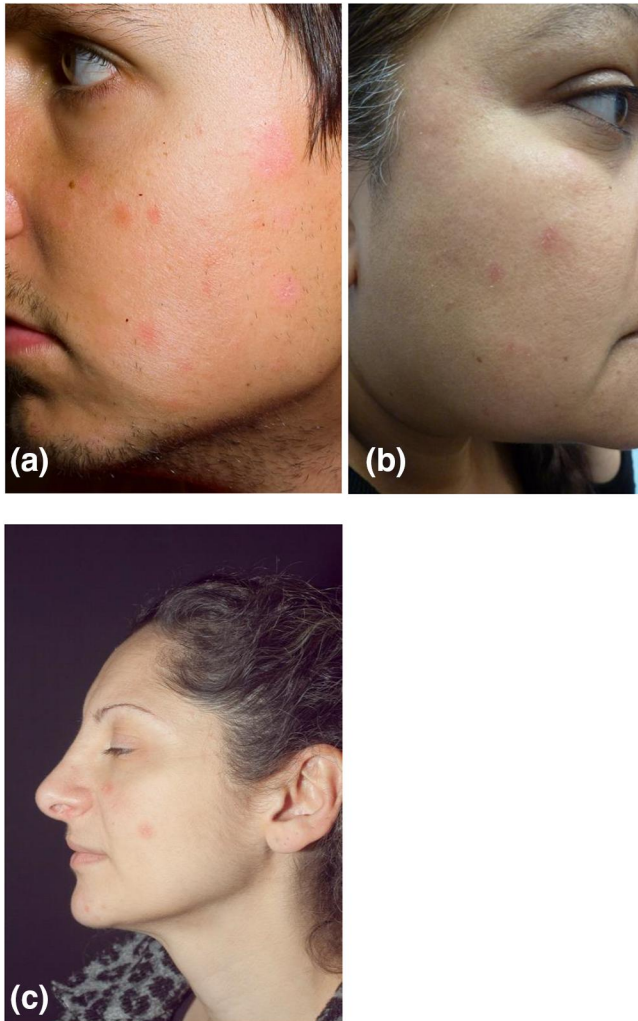
FIGURE 1 (a) Case 1 (b) Case 2 (c) Case 3. All three cases showed well-defined facial erythematous plaques

8 weeks but the facial plaques persisted. A trial of hydroxychloroquine 200 mg twice daily for 12 weeks for a presumed clinical diagnosis of discoid lupus erythematosus (DLE) gave no clinical improvement. This was followed by cryotherapy and five sessions of pulsed dye laser which was also ineffective. His lesions have persisted but have remained stable in number and extent without progression during a follow up period of 8 years.