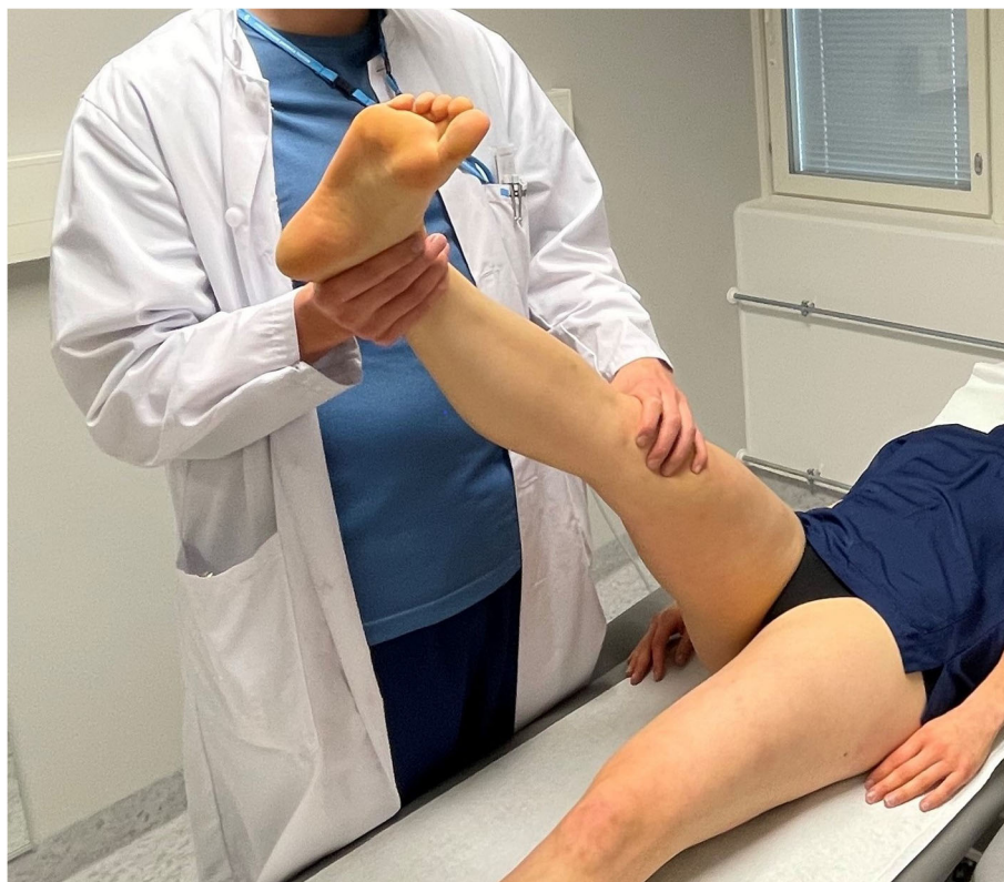
Fig. 1 Proximal structural differentiation for distal symptoms with hip internal rotation. Published earlier by Pesonen et al., BMC Musculoskeletal Disorders 2021 [14]

The ESLR started similar to the traditional SLR [11]: the patient lies supine on the examination table and the examiner passively lifts the subject's leg with knee straight (fully extended), hip in neutral rotational position and ankle hanging free. The leg raise was continued until the first symptoms were evoked or the subject's ongoing symptoms in the lower extremity are aggravated by 30%. If no responses are evoked by the hip flexion angle reaches 90 degrees, the leg raise is ceased, and the test is considered negative. The ESLR differs from the traditional SLR as the symptoms emerge: (i) the evoked responses do not need to reach below the knee, (ii) these responses do not need to emerge before 70 degrees but can happen anywhere from 0 to 90 degrees of hip flexion, and (iii) a structural differentiation maneuver is added to the SLR. To evaluate whether the evoked responses are neural or musculoskeletal in origin, a location-specific structural differentiation movement is added to the test at the hip flexion angle where these responses have been evoked/provoked. The added movement is selected based on the location of the evoked responses: If the symptoms are located distally, below the knee, a hip internal rotation (Fig. 1) is performed at the same hip flexion angle of evoked responses. In case the symptoms are provoked proximally in the