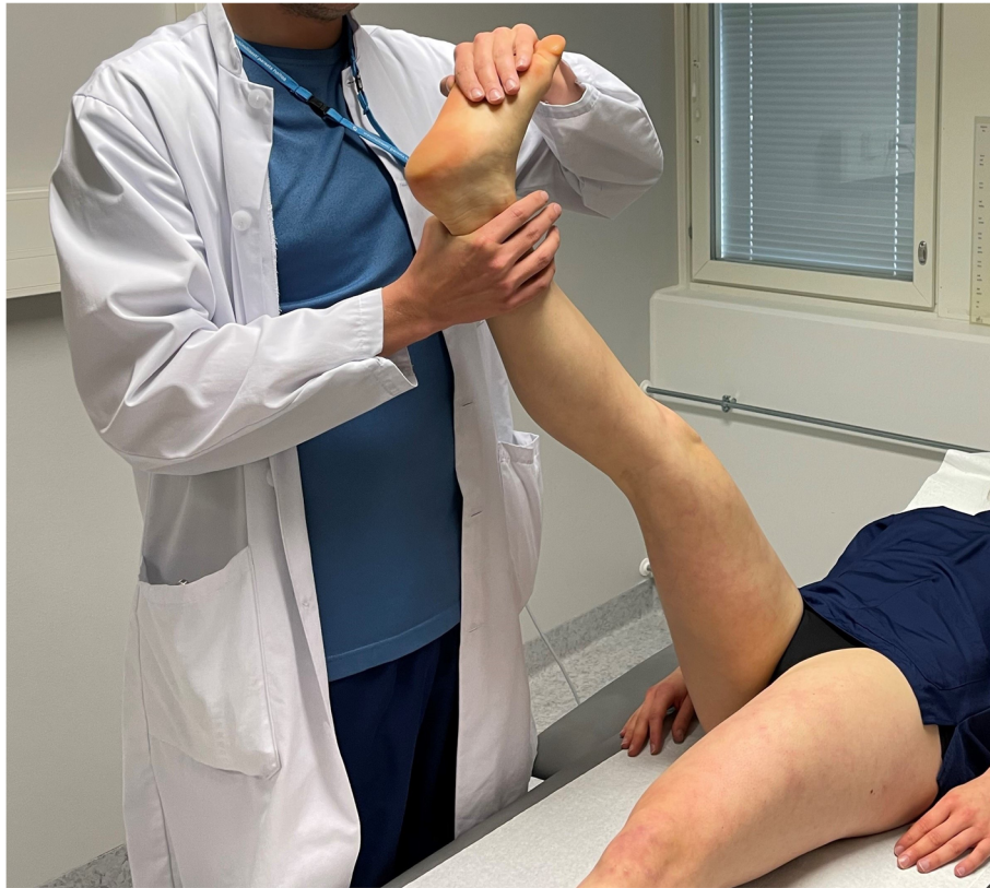
Fig. 2 Distal structural differentiation for proximal symptoms with ankle dorsiflexion (also known as Bragard test). Published earlier by Pesonen et al., BMC Musculoskeletal Disorders 2021 [14]

buttock and/or hamstring area, ankle dorsiflexion (Fig. 2) is the differentiating movement similar to the Bragard test [18]. An integral part in performing these structural differentiation movements is that, given the structural continuum of the nervous system, a movement known to move the sciatic neural structures and its contiguous nerve roots [19–21] at an asymptomatic musculoskeletal location may evoke referred responses in the area of interest.