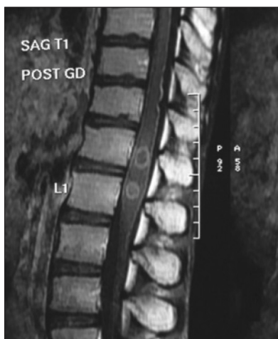
Figure 2: Post-Gadolinium magnetic resonance imaging image of dorso-lumbar spine revealing two ring enhancing lesion (target sign) at D12 and L1 level suggestive of tuberculoma