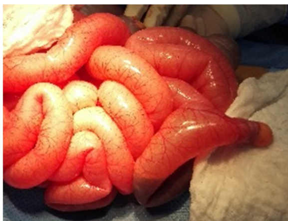
Fig. 1 Bleeding Meckel's diverticulum

football. On examination, his abdomen was slightly tender and bowel sounds were present. Initially, focused assessment with sonography for trauma (FAST) showed mild intraperitoneal fluid in his pelvis. A subsequent computed tomography (CT) scan of his abdomen revealed mild pelvic hemoperitoneum, but there was no definite solid or hollow visceral injury. So, he was admitted to the general ward for serial abdominal observation. On admission to the surgical ward, he was stable with a heart rate (HR) of 86 beats per minute (bpm) and blood pressure (BP) of 100/70 mmHg. His hemoglobin (Hb) was 9.6 gm/dl. We kept him nil per mouth and a nasogastric tube was inserted. The intake and output chart was regularly calculated. Serial Hb monitoring showed a continuous fall in his Hb level during the following days. He continued to have altered rectal bleeding. On day 3 his Hb dropped to 6.1 gm/dl, despite