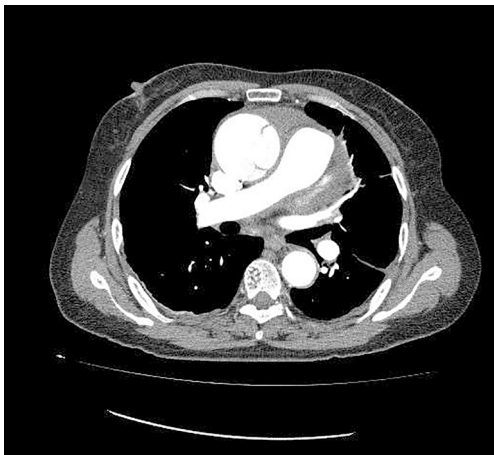
Figure 1 CTA images of acute type A aortic dissection. CTA, computed tomography angiography.