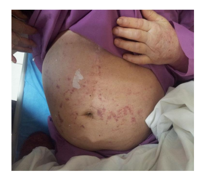
Fig. 1: Larva currents and urticarial in abdominal skin (Original)

beat/min. Chest sound was normal in auscultation of abdominal examination. The skin rash was linear erythematous and migratory similar to larvae current and urticaria (Fig. 1).