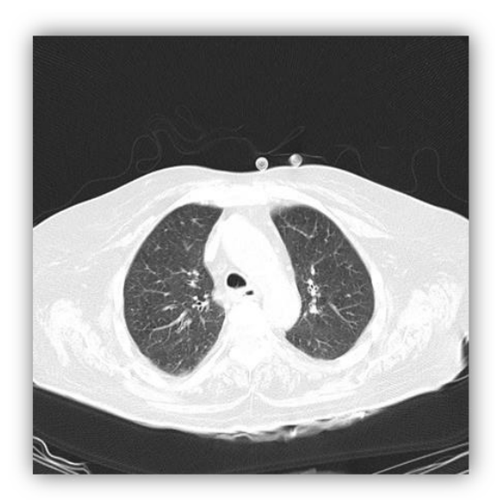
Fig. 2: Spiral lung CT parenchymal windows. Left-Pretreatment Right-post treatment 10 days after starting treatment