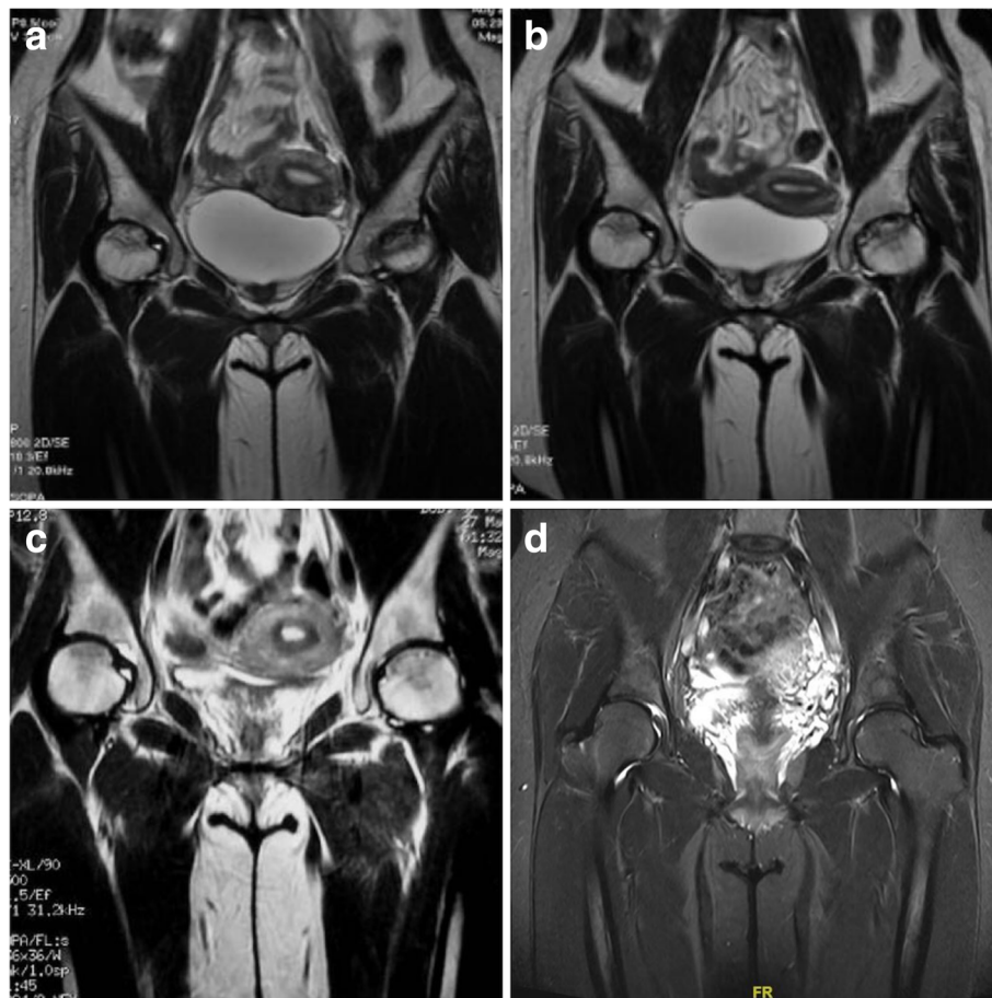
Fig. 1 MRI of a young woman with high-dose corticosteroid use: a MRI indicated bilaterally ARCO stage II ONFH before ESWT; b MRI in 3 months after ESWT; c MRI in 5 years after ESWT; d No lesion was observed in MRI at final follow-up. The patient has fully hip function without pain at the final follow-up

The current study showed that significant improvements in pain relief and function restoration were maintained for more than 10 years after ESWT. The mean Harris hip score improved from 77.4 before ESWT to 86.9 points at the final follow-up. The mean VAS score decreased from 3.8 preoperatively to 2.2 points at the 10-year follow-up. Four ARCO stage III hips and one ARCO stage II hip underwent THA during the follow-up due to unacceptable pain and hip dysfunction. The