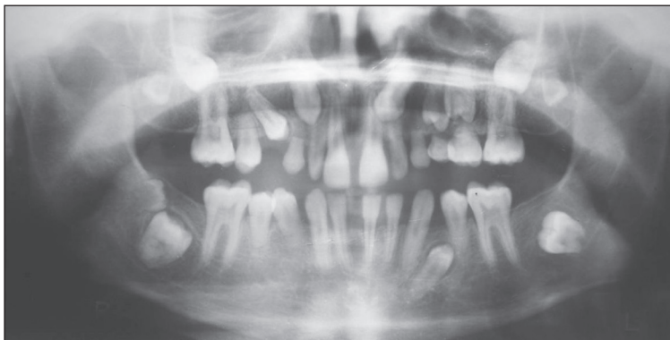
Figure 2. Orthopantomograph revealing multiple impacted teeth, short premolar roots, retarded root development of second molars, microdontia of third molars. Normal bone architecture is also noted.