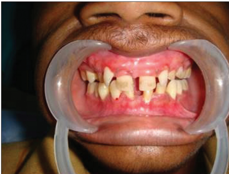
Figure 1. Clinical photographs revealing diastema in upper and lower arch; retained deciduous teeth (#53, #63, #64, and #65), missing permanent teeth (#13, #14, #17, #18, #23, #24, #25, #27, #28) and multiple missing permanent teeth (#34, #37, #38, #42, #47, #48).