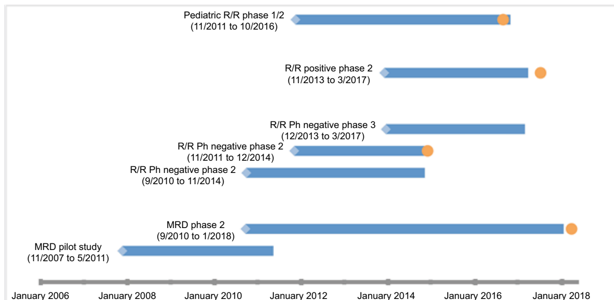
Figure 2 Development timeline of blinatumomab for the treatment of B-cell acute lymphoblastic leukemia.

In a Phase I/II study, blinatumomab was used in the R/R B-cell ALL in pediatric patients. 20 The Phase I study included 49 pediatric patients ranging from 2–17 years of age. The maximum tolerated dose of blinatumomab was 15 \mu\text{g}/\text{m}^2/24 hours, and the best approach was 5 \mu\text{g}/\text{m}^2/24 hours for the first week, increased to 15 \mu\text{g}/\text{m}^2/24 hours for the rest of the duration of the treatment. Twenty-seven of the 70 patients (39%) who received the recommended dosing schedule had a CR. Out of these responders, 52% had an MRD response after the first cycle. Median RFS over a median follow-up