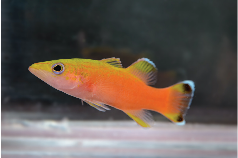
Figure 2. Holotype of Liopropoma incandescens (CAS 246199), 54.15 mm SL, shown alive in an aquarium.

Color in alcohol. In alcohol (Figure 1B), body light beige, pigment only present on a small patch of yellow on the snout, and the two pronounced dark spots on distal upper and lower caudal fin lobes.