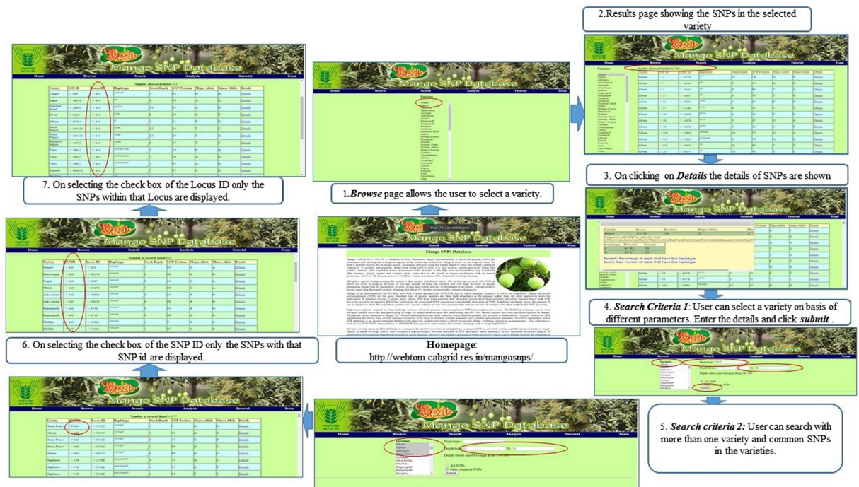
Figure 2. Workflow of the MiSNPDb genomic resource.

group i.e. haploid chromosome number 45 . Similar mapping and QTL discovery using RAD-based SNPs have been reported in barley as well 46 . In case of crop sesame, more number of RAD-based SNP has been added in the existing linkage map, to create ultra-dense genetic map or 'improved SNP map'. This approach has discovered more number of QTLs associated with economically relevant traits with identification of candidate genes in sesame 47 .