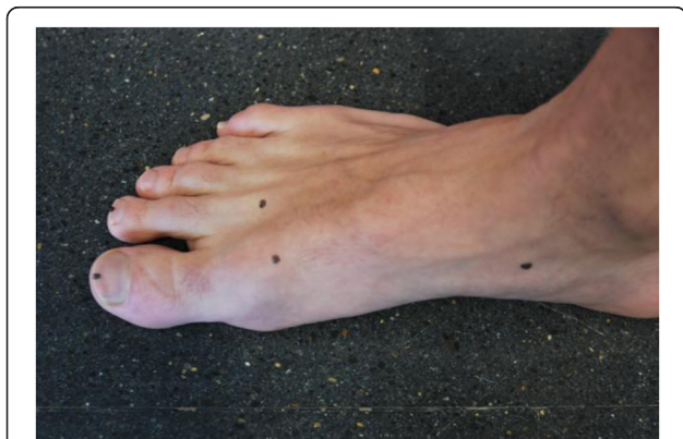
Figure 1 Standardised foot markings.

Once the foot was placed in the reference position, a carpenter's square was placed at the end of the first toe in order to keep it aligned with the lines of the graph paper. The investigator then used a paint spatula that had been dampened using a blue ink stamp pad, to make a blue line parallel to the graph lines at the end of the toe, between the first toe and the edge of the square. The procedure was repeated under identical conditions with the second toe (Figure 3). The difference between the ends of both toes was determined using a ruler in