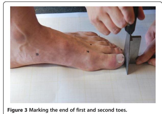
Figure 3 Marking the end of first and second toes.