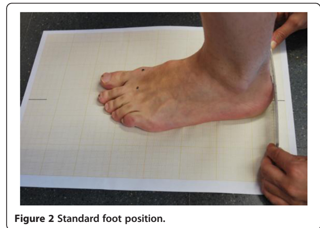
Figure 2 Standard foot position.

Using the method described by Davidson et al. [12], the dorsal crease of the first and second metatarsophalangeal joints as well as the medial aspect of the navicular tuberosity were identified and marks made at each of these bony landmarks (Figure 1). A vertical reference line, between one point at the base of the calcaneum