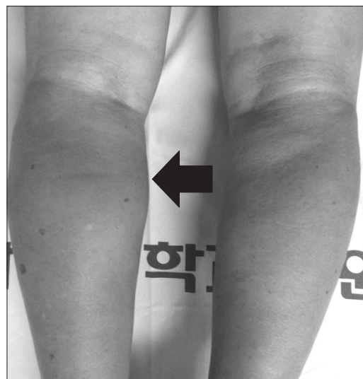
Fig. 1. The photograph of both legs shows swelling without redness in the left calf. The arrow points to the left calf.

An 81-year-old man with a major complaint of painful mass at the lower calf was referred to our institution. Pain and swelling in his left lower leg started to develop 2 weeks prior to his presentation to our clinic and progressively worsened, eventually rendering him unable to walk. While he denied any trauma to that leg,