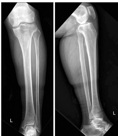
Fig. 2. Plain radiographs of the left leg show severe osteoarthritis of the knee joint and elongated soft tissue density along the medial aspect of the proximal lower leg.

he had been taking aspirin 100 mg, amlodipine 5 mg, candesartan cilexetil 8 mg per day for 7 years to control his hypertension, and had a history of several times of injections in the left knee for 1 year because of osteoarthritis.