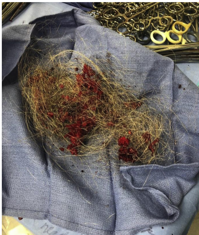
Fig 3. Coils from prior percutaneous translumbar coil embolizations extracted from the patient.

offered for iliac aneurysms that are growing or persistent in size as a result of the endoleak. 6,14