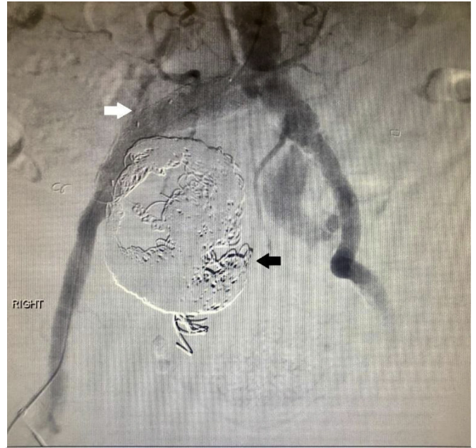
Fig 2. Angiography with patent stent graft from common to external iliac artery on the right side (white arrow), no flow through proximal right internal iliac artery, and large coils protruding toward midline (black arrow).

pulses were confirmed and the revascularization deemed successful, both groins were closed and isolated.