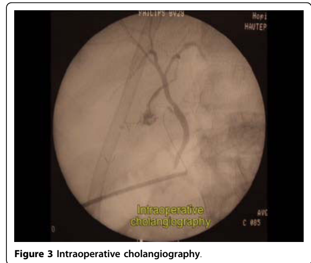
Figure 3 Intraoperative cholangiography.

4.10-10.50 10*9/L) - and the persistence of abdominal pain, an hepatic MR with TESLASCAN (fig 2) was performed which showed a biliary leaks originating from left liver. Laparoscopic exploration revealed an intense biliary peritonitis. Liquid sample was performed. Hepatic exploration confirmed the presence of a liver fracture of segment IV without signs of active bleeding. Cholecystectomy followed by a trans-cystic cholangiography (fig 3) showed a biliary leaks of left hepatic biliary tract, involving sectorial pedicle to segment III. Hemostatic and tissue sealing (Nycomed TachoSil®) surgical patch was applied on liver injury, in order to minimized biliary spillage. Two intra-abdominal and a trans-cystic biliary drains were inserted in view to drain abdominal cavity and biliary tree, respectively (Additional file 1). Postoperative outcome was uneventful and patient was discharged at postoperative day 18 th .