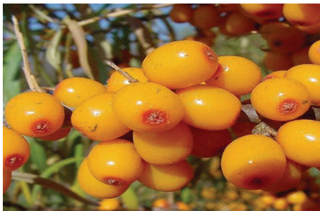
FIGURE 1: Sea buckthorn fruits.