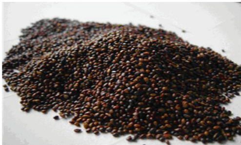
FIGURE 2: Sea buckthorn seeds.