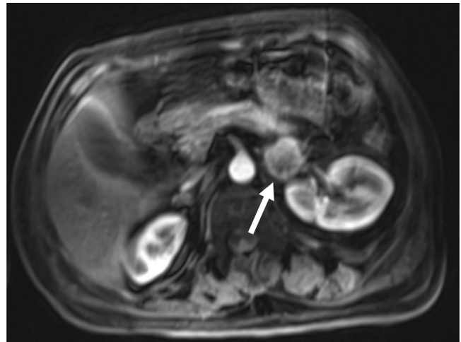
Fig. 1 – Contrast enhanced magnetic resonance (MR) image of the abdomen demonstrated a 2.8 \times 2.9 \times 3.3 cm nodule of the left adrenal gland (white arrow)

Given this, the interventional radiology service was consulted for AVS to localize and confirm the left adrenal nodule as an ACTH-producing pheochromocytoma. Prior to the procedure the patient was started on a phenoxybenzamine alpha-blockade. As opposed to sampling for ACTH with IPSS, stimulation with corticotropin-releasing hormone (CRH) was not necessary as it would not have influenced ectopic ACTH sources and is meant to minimize the pulsatility of the pituitary gland [3]. AVS was performed in standard fashion involving selection of the left adrenal vein with a Simmons 2 (Cook Medical, Bloomington, IN) catheter and the right adrenal vein with a Cobra 2 (Cook Medical, Bloomington, IN) catheter (Fig. 2). However, there were several specimen collection and handling considerations for sampling of ACTH from adrenal glands. For each site, a separate sample was sent each for cortisol, catecholamine fraction, and ACTH. Catecholamine fraction including epinephrine values were obtained to confirm adequate sampling of the adrenal gland, similar to that advocated for AVS in cases of hypercortisolism, and these samples were placed in pre-chilled catecholamine tubes contain-