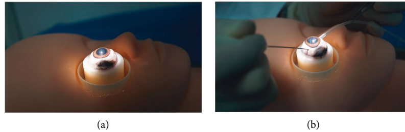
FIGURE 1: Steps of the vitreoretinal surgery. (a) Fix the porcine eye at the eye seat model. (b) Two incisions were made at the location of 4 o'clock and 10 o'clock, 2 millimeters away from the corneal limbus, with a 25-gauge needle and the probe of endoscope entering the eye.

endoscope; thus, it could observe the structure under the proliferative membrane much more clearly [15].