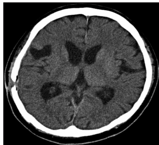
Figure 3: Axial noncontrast follow-up CT brain 6 months postoperatively shows complete resolution of initial right-sided CSDH and stable right frontoparietal gliosis