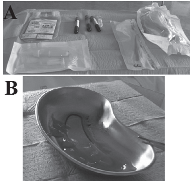
Figure 1. PRP kit (A), PRP Gel (B)

At first it is necessary a proper request to the transfusion center; the Nurses pick up the PRP kit composed by a Platelet, an infusion set, three serum tubes with thrombin (Figure 1A).