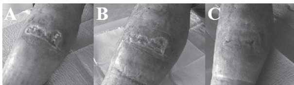
Figure 3. Evolution of injury: day 0 (A), 2-week follow-up (B), final 4-week follow-up (C)

The third case is a wide wound of the forearm in a young man after a car accident. The patient sustained fracture of the proximal ulna with soft tissue loss. The lesion was followed by an initial compartment syndrome. After 19 days the wound was dry with regular edges and initial presence of granular tissue at the bottom so we decided for PRP application (Figure 4A). At two weeks check-up the lesion was red-colored with well-defined edges and reduced limb edema (Figure 4B). After physiological saline cleaning, we had to apply low adhesion gauze and zinc paste bandage in order to reduce excessive granulation. About 45 days after trauma the patient had bacterial infection of the