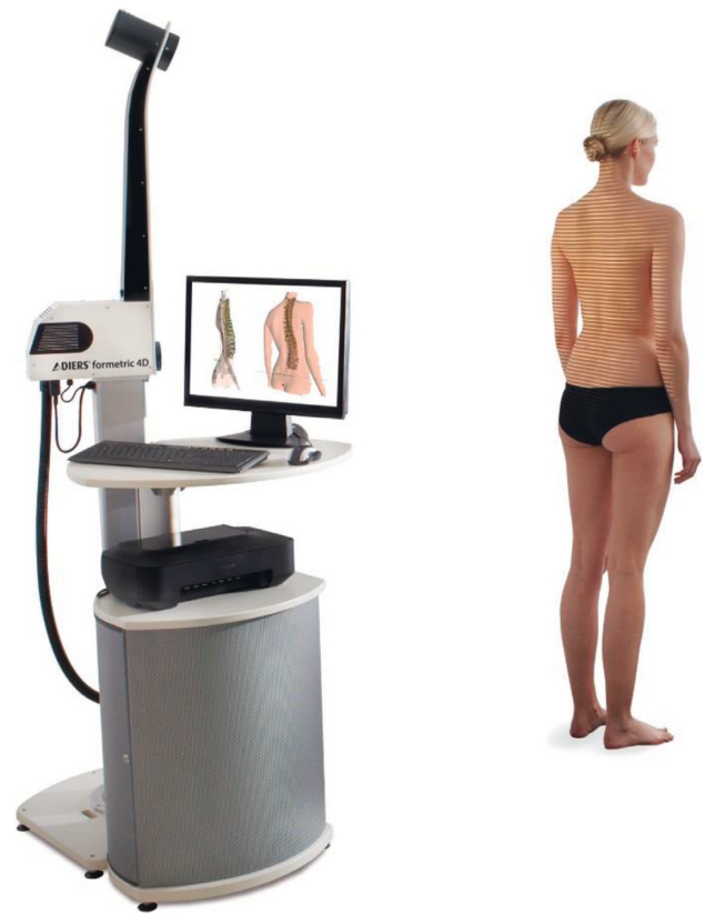
FIGURE 1: Example of formetric 4D projection unit set-up with participant positioning.

The formetric 4D scanning protocol performed in the current study was consistent with the manufacturer's guidelines and has been previously reported in detail [21]. Participants were positioned 2 meters from the formetric 4D projection and camera unit (Figure 1). The unit projected stripes of light on the surface of the participant's back (Figure 2(a)). Images of the surface of the back were recorded, digitized, and represented in 3D space (Figure 2(b)). Surface mean and Gaussian curvature were calculated (Figure 2(c)), and the underlying spine was rendered (Figure 2(d)). Each scan recorded 12–13 images over 6 seconds (2 Hz) and was processed based on the manufacturer's instructions. The instrument then produced 40 named spine shape parameters from a single image that is closest to the average position of the participant. Being