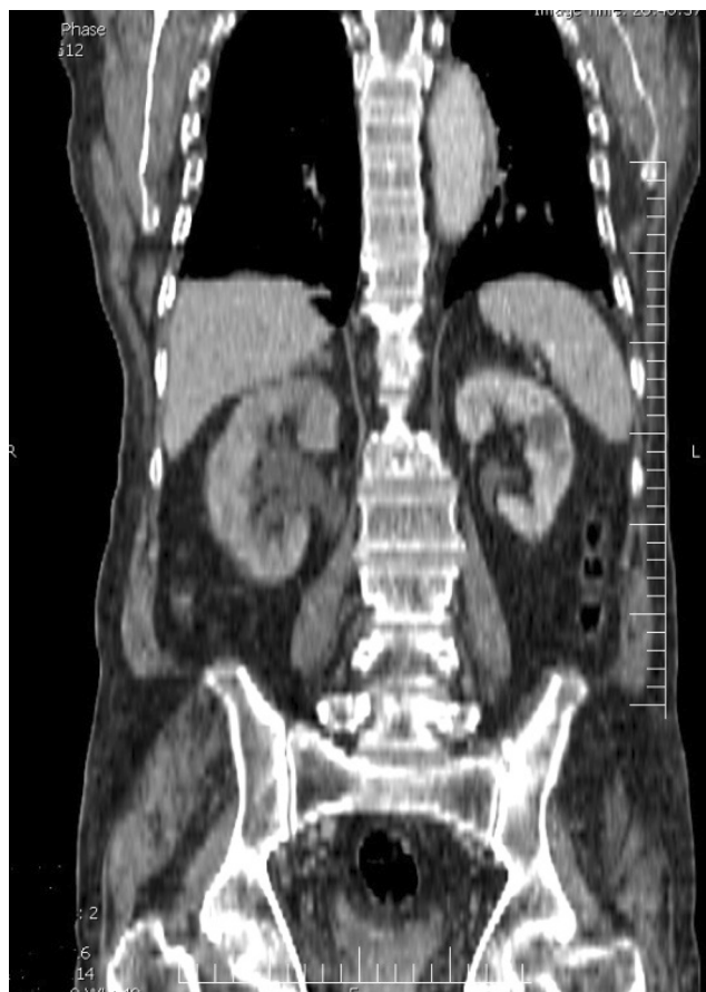
Figure 3 Hydronephrosis in the right kidney in the coronal cut of abdominopelvic CT scan.

set by the urologist. The samples were sent to pathology separately.