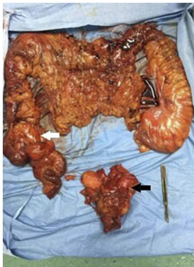
Figure 4 Surgical specimen following of total colectomy (the cecal mass was represented with white arrow) and total cystoprostatectomy (the specimen of prostate and bladder was highlighted with black arrow).

Grossly, the total colectomy specimen included colon sized 90×5.5 cm, a portion of ileum sized 20×1.8 cm, cecum sized 6×1 cm, and omentum sized 40×18 cm. On opening, a gray polypoid mass sized 4×3×3.5 cm was identified near the ileocecal valve, with distances from proximal and distal margins 23 and 63 cm, respectively. Apart from the whole specimen, there were 23 lymph nodes. The next one was a radical cystoprostatectomy specimen which included bladder sized 7.5×7×3.5 cm, covered by perivesical fat sized 10×5×4 cm, prostate gland sized 4.5×3.5×3 cm, right seminal vesicle sized 3.5×1 cm, left seminal vesicle sized 2.5×1.2 cm, right and left vas deferens sized 7.5×0.5 cm and 6.5×0.4 cm, respectively. The external surfaces of the specimen are unremarkable. On opening, a cream rubbery projected mass sized 1.8×0.7×0.5 cm is located on the anterior and lateral walls of the bladder. Cut section of the prostate gland revealed bilateral multifocal yellow discoloration up to 0.7 cm in diameter (Figure 4).