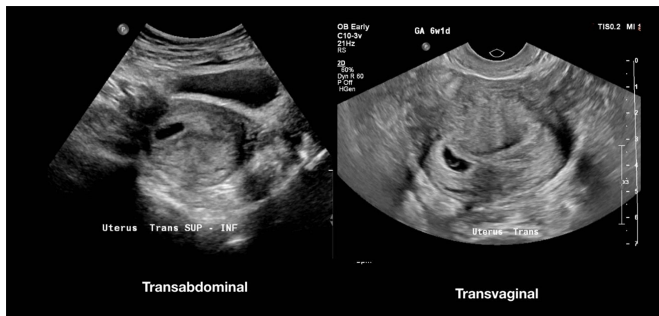
Figure 2 Transabdominal and transvaginal image of one study wherein the two ED physicians disagreed about the presence or absence of an intrauterine pregnancy on transabdominal imaging.

Out of the 108 total included patients, there were two ectopic pregnancies. In both of these cases, each of the emergency physicians noted the absence of an IUP. There were no cases of heterotopic pregnancy in this cohort. If the patients who had an identifiable IUP on TAUS had not received TVUS, it would have resulted in a theoretical reduction of TVUS performed on this patient cohort by 54% (EP 1) or 63% (EP 2). This is shown in Table 7.