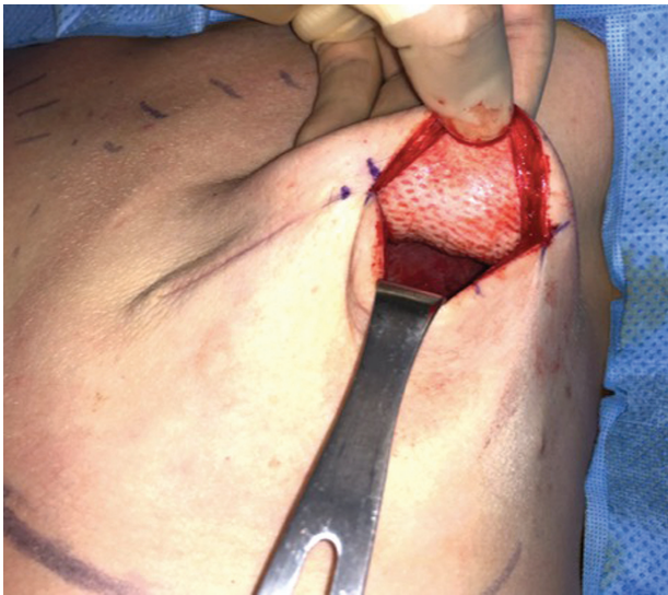
Fig. 3 100% meshed acellular dermal matrix incorporation at implant exchange.

mean intraoperative initial fill volume was 248.9 \pm 105.0 mL ( 52.7\% \pm 18.0\% ), and the mean final tissue expander fill volume was 424.6 \pm 145.9 mL (range 150–700 mL). The average time for drain removal was postoperative day 18.8 \pm 6.6 (range 8–32 days). ADMs 6 \times 16 cm ( n = 46 , 62.2%) and 8 \times 16 cm ( n = 28 , 37.8%) were used, respectively (► Table 3 ).