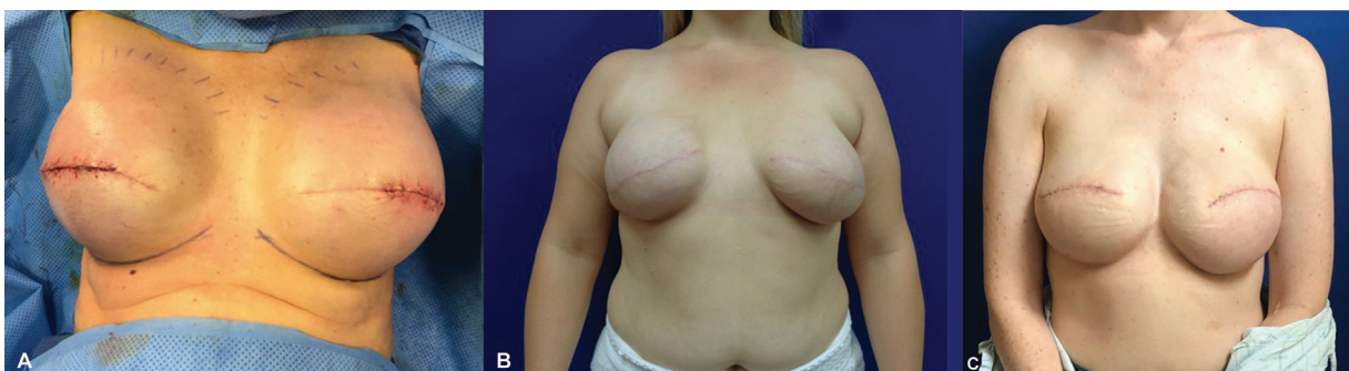
Fig. 4 Postoperative pictures of breast reconstructive patients using meshed ADM. (A) Patient 1 intraoperative image at implant exchange. (B) Patient 2 at 5 months status postimplant exchange. (C) Patient 3 at 4 months status postimplant exchange.

At our institution, using a single-meshed 6 \times 16 cm sheet of ADM instead of a 16 \times 20 cm unmeshed sheet resulted in a saving of $6,601 for a unilateral, and $13,202 for a bilateral tissue expander reconstructive procedure. For bigger expanders with larger surface area and width, where a meshed 8 \times 16 cm sheet was needed, the cost savings was $5,659 and $11,318 in unilateral and bilateral breast reconstructions,