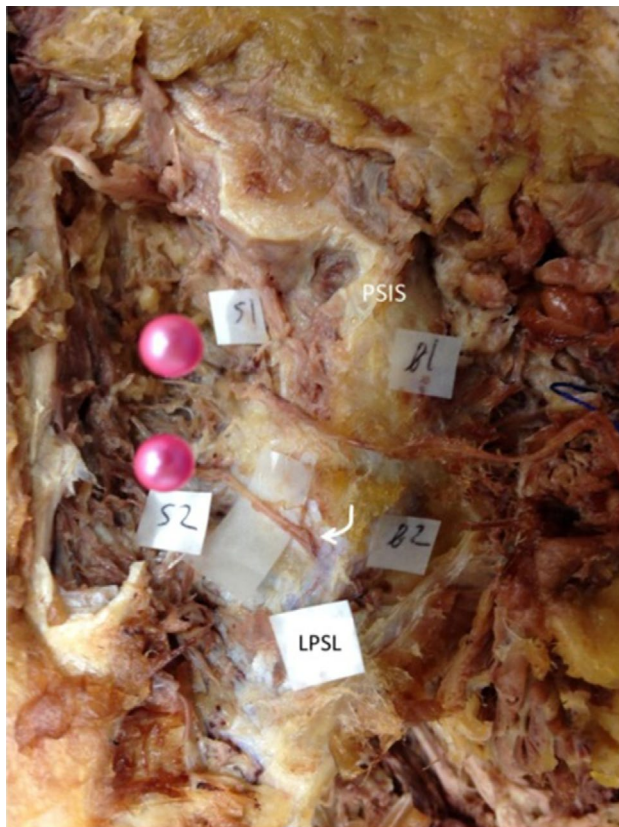
Figure 2 Photograph showing MCN branches traversing over and under the LPSL on the left side in a cadaveric specimen obtained from an 88-year-old woman (specimen no. 21).

Some of the penetrating MCN branches extended a thin nerve fiber that disappeared into the sacroiliac joint (SIJ). Anastomosis between the MCN and SCN was sometimes found in subcutaneous tissues of the buttock. We also found some communicating branches from the MCN to the superior gluteal nerve (SGN).