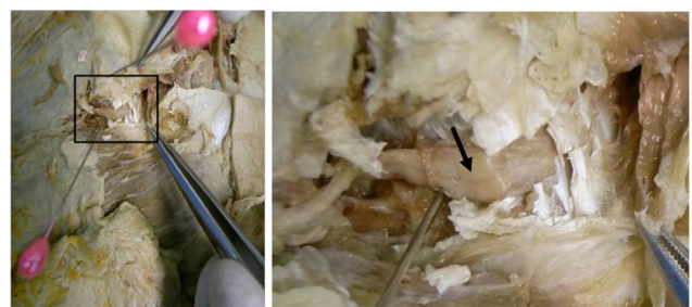
Figure 3 Photographs (overview of pelvis, left and close view, right) showing entrapment of the MCN under the LPSL obtained from an 85-year-old woman (specimen no. 7).

Several researchers consider the LPSL to be a major pain generator of SIJ pain. 16,18,23–25 Fortin and Falco 20 stated that SIJ patients could localize their pain with one finger and the area pointed to was within 1 cm inferomedial to