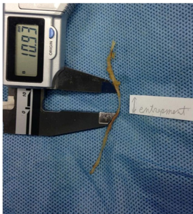
Figure 4 A narrowed portion of the MCN obtained from an 81-year-old woman (specimen no. 1). Approximately 10 mm of the MCN is narrowed, reflecting the width of the LPSL.

Abbreviations: MCN, middle cluneal nerve; LPSL, long posterior sacroiliac ligament.