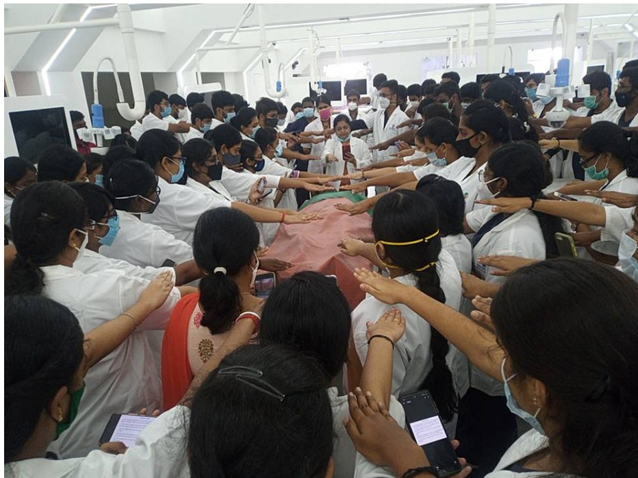
FIGURE 1: The donor oath taken by phase I MBBS students