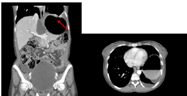
Fig. 1. Computed Tomography (CT) scan: left diaphragmatic hernia with incarceration of stomach in the chest (arrow).

Case 4. A 56-year-old patient with stage IVB HGSO underwent three