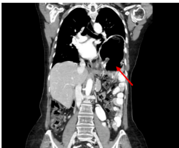
Fig. 4. Computed Tomography (CT) scan: large left diaphragmatic hernia with stomach and bowel content (arrow).

through the left diaphragm, which required emergency laparotomy and repair (Caronna, 2013). A second case report described a patient diagnosed with pseudomyxoma peritonei due to adenocarcinoma of the appendix. Cytoreductive surgery included right colectomy with an anastomosis of the ileum and transverse colon, partial gastrectomy, splenectomy, cholecystectomy, , peritonectomy of the right and left upper quadrant, , and HIPEC. The patient had symptoms of chest pain and dyspeptic disorder, and CT scan showed a left diaphragmatic hernia. This report also described a second patient with locally advanced gastric cancer, status post cytoreductive surgery including total gastrectomy, splenectomy and segment resection of the transverse colon, and HIPEC. Postoperatively she was diagnosed with a left-sided pleural abscess. A biopsy was performed on the abscess and showed intestinal contents, due to an anastomotic leak of the left colonic flexure communicating with the left hemithorax (Lampl, et al., 2014). The third published case report describes a patient with pseudomyxoma peritonei of the appendix, who underwent cytoreductive surgery including peritonectomy of the right and left upper quadrant, cholecystectomy, and HIPEC, and presented postoperatively with a left-sided diaphragmatic hernia (Sorrentino, et al., 2017).