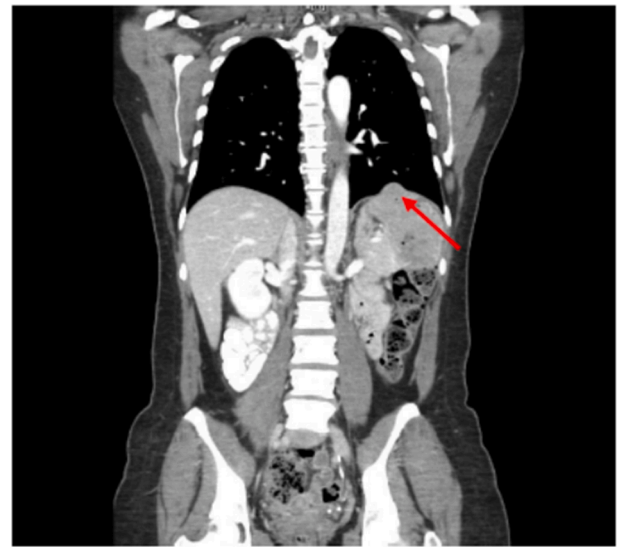
Fig. 2. Computed Tomography (CT) scan: small left diaphragmatic hernia (arrow).

cycles of NACT with paclitaxel and carboplatin, followed by IDS with a left-sided thoracoscopic procedure, left diaphragmatic peritonectomy, full thickness resection of the right diaphragm, resection of a liver lesion, partial gastrectomy with a gastrojejunostomy, small bowel resection with a side-to-side anastomosis, splenectomy, a modified posterior exenteration with end-to-end anastomosis and diverting loop ileostomy. The residual tumor was less than 5 mm. Her past medical history was significant for hepatitis B. Approximately 8 months after IDS, the patient had a CT scan which revealed progressive disease and an asymptomatic left diaphragm hernia containing bowel and stomach contents (Fig. 4). The patient underwent a left thoracotomy, reduction of the intrathoracic stomach and repair of the left diaphragm hernia with mesh reinforcement. She was discharged on postoperative day 2. A follow-up CT scan 1.5 months later showed a repaired diaphragm.