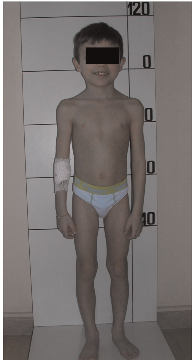
Figure 2. Patient's phenotype.

showed a short first metacarpal bone but no sign of skeletal dysplasias. Dysmorphic evaluation did not reveal any particular syndrome. Chromosome analysis disclosed a normal 46,XY, karyotype.