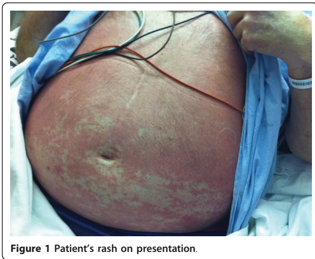
Figure 1 Patient's rash on presentation.

computed tomography (CT) scan of his pelvis showed no abscess formation. A skin biopsy of the initial rash showed a mild perivascular lymphocytic infiltrate, consistent with a drug reaction.