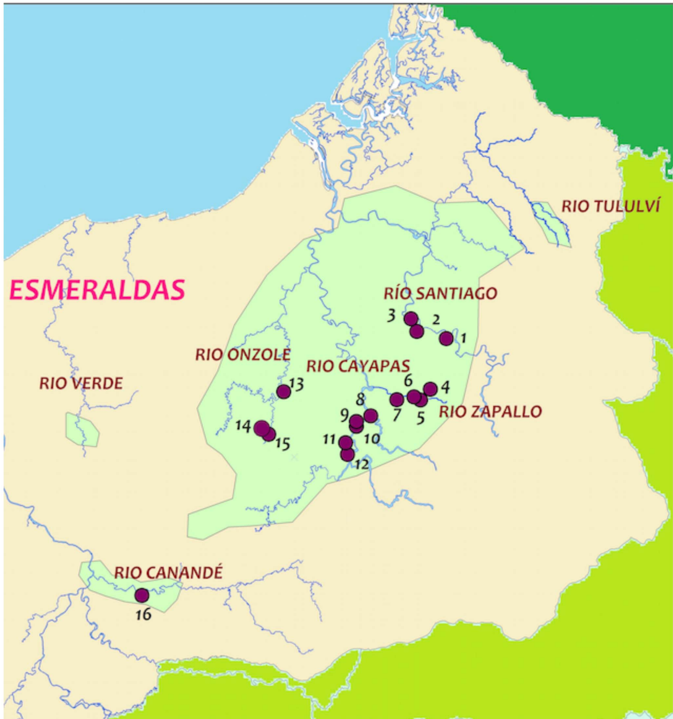
Figure 1. Map of the endemic area and locations of the entomological and serological surveys carried out between 1995 and 2008. 1- Playa de Oro, 2- Angostura, 3- Guayabal, 4- Agua Salada, 5- Pichiyacu, 6- Playa Grande, 7- Herradura, 8- San Miguel, 9- El Tigre, 10- Agua Blanca, 11- Callemansa, 12- Corriente Grande, 13- Colón de Onzole, 14- Calpulí, 15- Las Pavas, 16- Naranjal. doi:10.1371/journal.pntd.0002821.g001

April-June, 2012; these months correspond to the peak of transmission. Parous females were not separated from nulliparous insects as these samples were used in a pool screening assay. Collections were carried out from 0800-1700 each day for 8 days per month. Flies were collected for 50 minutes each hour, allowing a 10-minute break to the collectors during each hour. The collected flies were sorted according to species