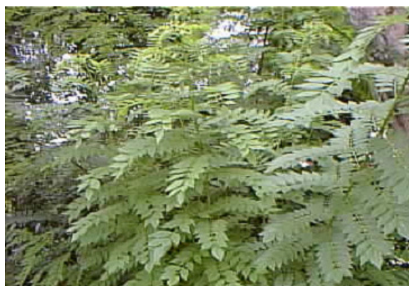
FIGURE 1. G. sepium in its natural habitat from a farm.

The greenhouse experiment was designed for evaluating the efficacy of the various treatments. Each treatment was applied at 5, 10, and 15 t/ha in 2-kg plastic pots in a randomized complete block design. Soil weight was 1.8 kg per pot. A. caudatus was planted twice successively, for main and residual effects. The ambient air temperature was about 28 to 30°C. A. caudatus was planted 1 week after the incorporation of the various treatments.