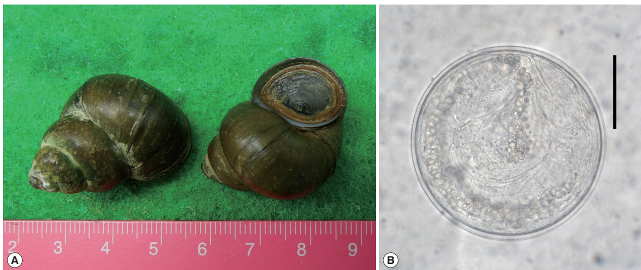
Fig. 1. (A) Two Chinese mystery snails, Cipangopaludina chinensis malleata , the second intermediate host of E. macrorchis , collected from a field of Xiengkhuang Province, Lao PDR. (B) A metacercaria of E. macrorchis detected in a Chinese mystery snail. Scale bar is 50 µm.

We basically measured the body length (BL) and width (BW), the size of oral sucker (OS) and ventral sucker (VS), pharynx, esophagus, head collar, cirrus sac, ovary and 2 testes, and additionally the forebody length (FBL: from the anterior