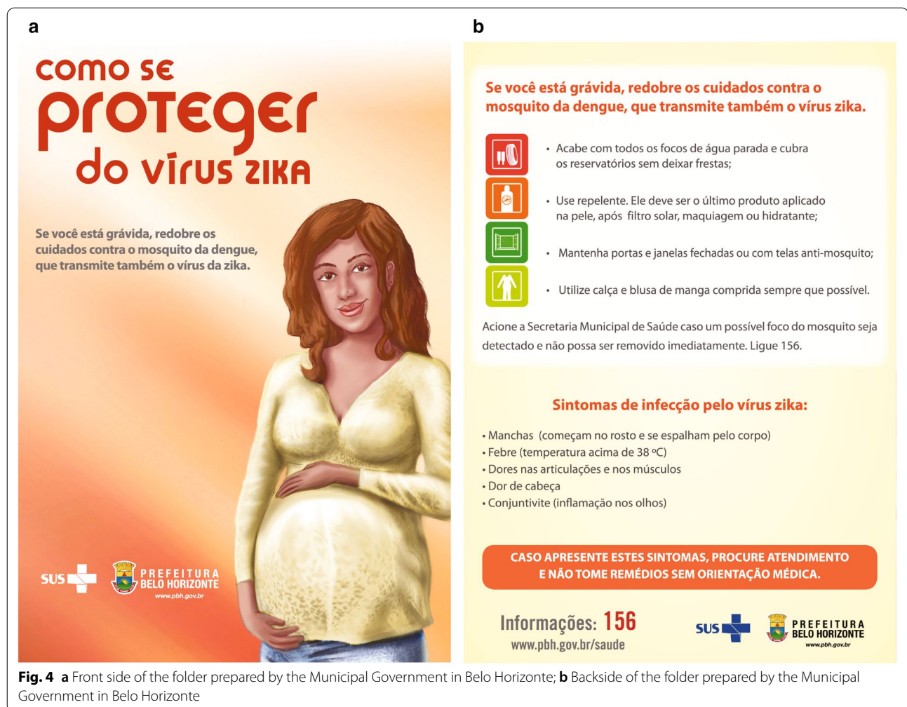
Fig. 4 a Front side of the folder prepared by the Municipal Government in Belo Horizonte; b Backside of the folder prepared by the Municipal Government in Belo Horizonte

Males were often depicted in ads, as can be seen on Table 2, but were rarely the protagonists, sometimes just lending parts of their bodies or assuming a secondary role. In many cases, they lent their voices to narrate a radio ad or posed on print materials as a physician, both roles that imply a position of power, not of victimization or responsibility.