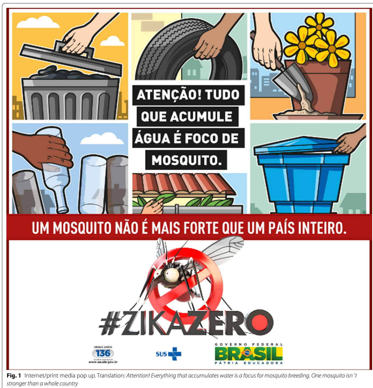
Fig. 1 Internet/print media pop up. Translation: Attention! Everything that accumulates water is a focus for mosquito breeding. One mosquito isn't stronger than a whole country

institutions (Table 1, panel A). Although state and municipal administrations also have their own campaign materials, they more often reproduced the materials made available by the Ministry of Health. 2