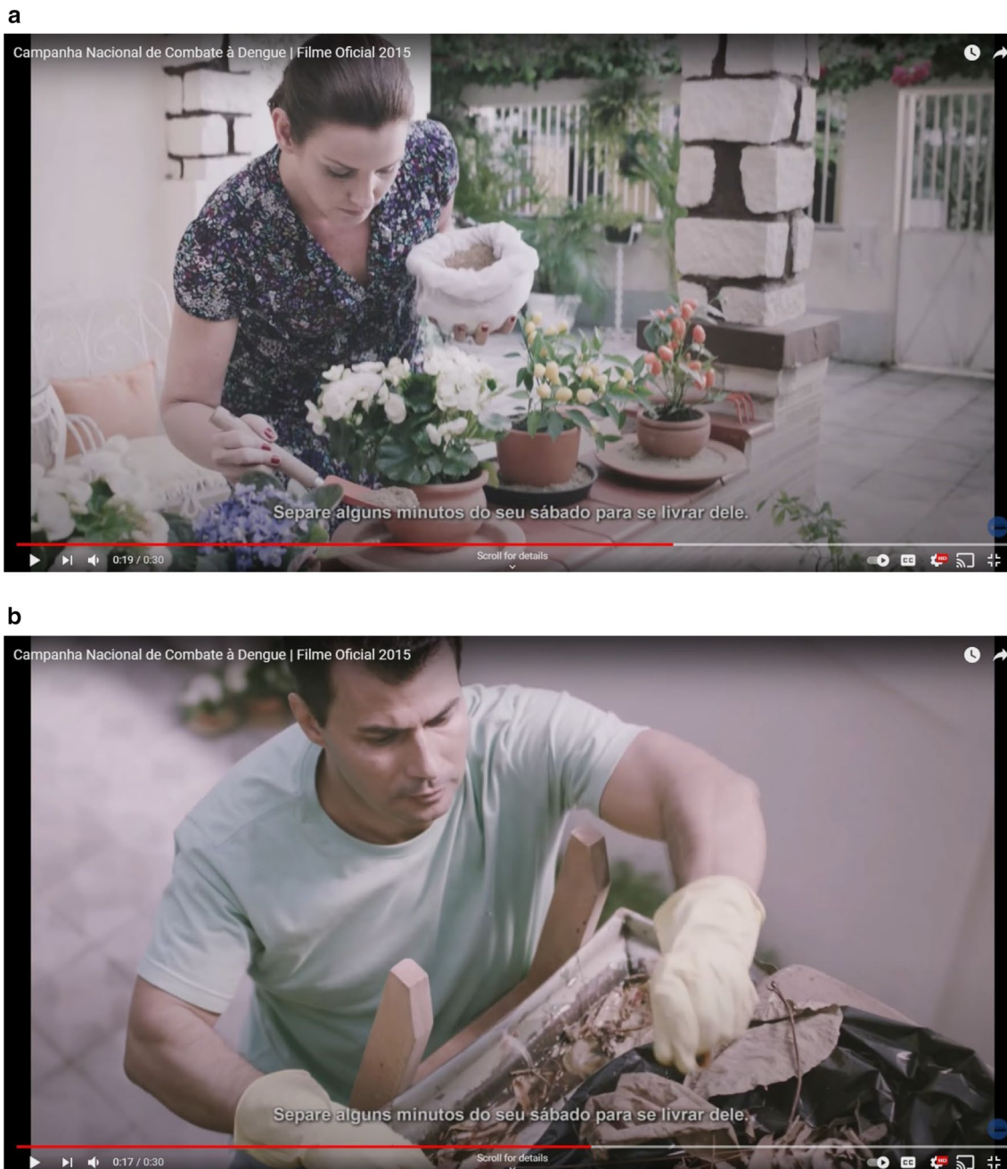
Fig. 5 a Woman places sand inside the flower vases; b A man uses a ladder to reach the roof and clean the gutters

( Gestante ) neglected women who are not pregnant. The challenges of implementing safe sex, discussed in the next sections, also remained unaddressed.