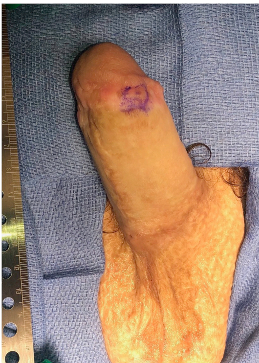
Fig. 2. Patient status post chemical debulking, resection, and skin grafting. Recurrent condyloma acuminatum excised (circled area).

Patient reports painful erections and is under a pain management program.