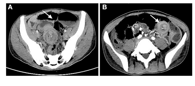
FIGURE 1 | (A) Abdominal CT scan first noticed intestinal obstruction with sign of air-fluid level instead of intussusception. (B) Transverse section of CT scan indicated intussusception with sign of "target-like" or "concentric double ring" (both are indicated by white arrow above).

Main etiologies of pediatric and adult intussusception are attributed to be idiopathic or underlying intestinal lesions associated with anatomic or infectious factors, postoperative