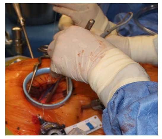
Figure 2. Endoscopic mitral valve surgery using long-shaft instruments and peripheral cannulation.

The choice of prosthesis should be individualized within the context of patient expectations, values, and health care preferences. The advent of transcatheter mitral valve devices will