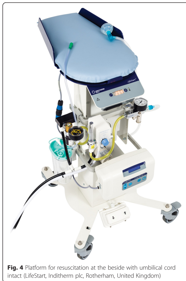
Fig. 4 Platform for resuscitation at the bedside with umbilical cord intact (LifeStart, Inditherm plc, Rotherham, United Kingdom)

For the clinician, there is insufficient strong evidence to guide either the length of the delay before clamping the umbilical cord or the extent of resuscitative interventions provided to preterm infants during a delay. In many trials, no resuscitative intervention was provided; in other studies, infants were provided the initial steps of resuscitation (drying, positioning and clearing the airway as needed, specific stimulation to breathe i.e. rubbing the back) [43, 48]. Theoretical and practical challenges merit carefully controlled trials of beginning positive-pressure ventilation with intact umbilical circulation. Although positive-pressure ventilation may be necessary to aerate the lung and increase pulmonary blood flow, experimental animal studies suggest excessive end-expiratory pressure or mean airway pressure may not only cause lung injury, but may also impair cardiovascular transition and result in potential cerebral injury [50].