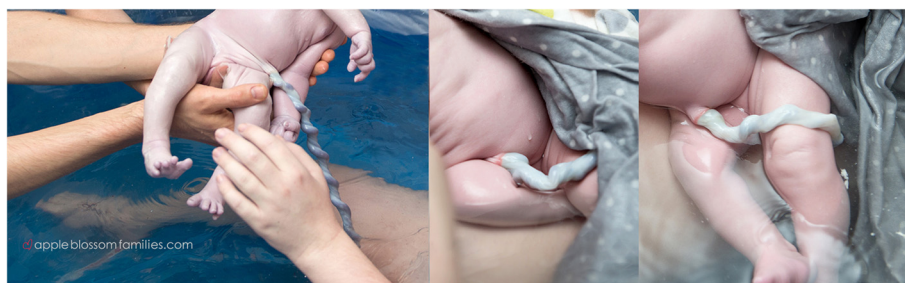
Fig. 3 Change in appearance of the umbilical cord from birth, to 12 and 23 min after birth, with umbilical cord intact and completion of third stage of labor at 30 min

The preterm infant who is healthy may cry and breathe spontaneously or may have delayed onset of spontaneous respirations or shallow, irregular breathing after birth [37]. When general anesthesia at preterm delivery is necessary for maternal medical or obstetrical conditions, the newly