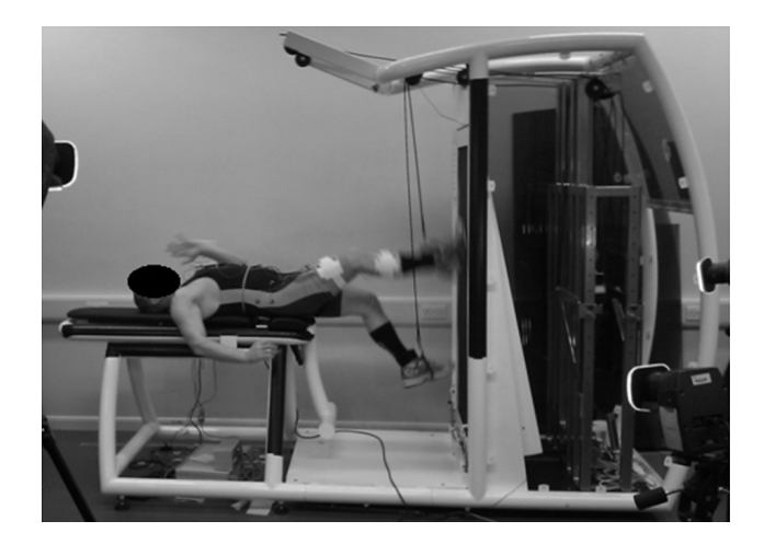
Fig. 1. The VertiRun (Sheffield, UK) being used in the supine posture.

ered to the ankle and offer resistance to the musculature of the posterior chain (20 N on the uptake of tension up to 70 N as the leg descends to the lowest point of the treadmill). Therefore, the magnitude of the resistance is dependent on the leg length and the lower limb range of motion of the user.