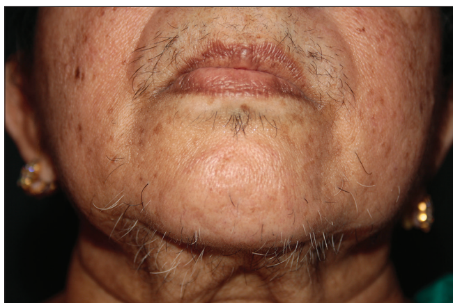
Figure 1: Hair growth around the chin and lip following the use of bimatoprost eyedrops

Hypertrichosis of lashes is now a desirable outcome for patients who prefer to have longer eyelashes. Latisse (Allergan Inc. Irvine, CA) which is bimatoprost 0.03% solution and identical to the ophthalmic solution for glaucoma treatment, was approved by the US Food and Drug Administration (FDA) for increasing eyelash length, thickness and darkness in patients with hypotrichosis of the eyelashes. Although bimatoprost is effective in promoting increased growth of healthy eyelashes and adnexal hairs, it may not be effective in patients with eyelash alopecia areata and in patients with eyelash loss secondary to radiation or chemotherapy. It seems that prostaglandin or prostamide analogs are only effective in promoting eyelash regrowth in patients with a mild form of eyelash alopecia areata. [9] Apparently, an intact hair follicle is necessary for exogenous prostaglandin analogs to be effective in the promotion of hair growth. This reasoning explains why our patient (who already had few terminal hairs