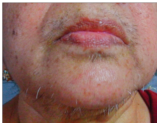
Figure 2: Slight reduction in the hair growth around the chin and lip after stopping bimatoprost eyedrops