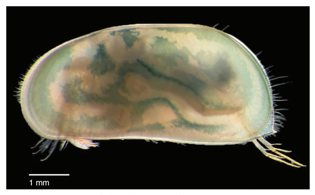
Figure 2. Preserved specimen of Chlamydotheca unispinosa from Bottomless Ghaut, Montserrat, approximately 4.1 mm long. Living individuals were colored bluish-green.

rat ostracod were downloaded and aligned using ClustalW (MEGA, Tamura et al. 2013). Alignments were edited and poorly aligning flanking regions were removed. Aligned sequences were translated, using an invertebrate mitochondrial genetic code table, into amino acid sequences to check for alignment errors. A neighbor-joining tree (bootstrap, 1000 replications) was constructed of COI sequences representing the Montserrat ostracod and the four most similar species published in GenBank, as well as a sequence from one more distantly related ostracod, Conchoecetta cuminata Claus, 1890 (Podocopida, Cytherideidae) as an outgroup (MEGA). Pairwise distances (p-distance, complete deletion) were calculated between the nucleotide sequences of the Montserrat ostracod and the four most similar published sequences, as well as one with the outgroup sequence of C. cuminata (MEGA).