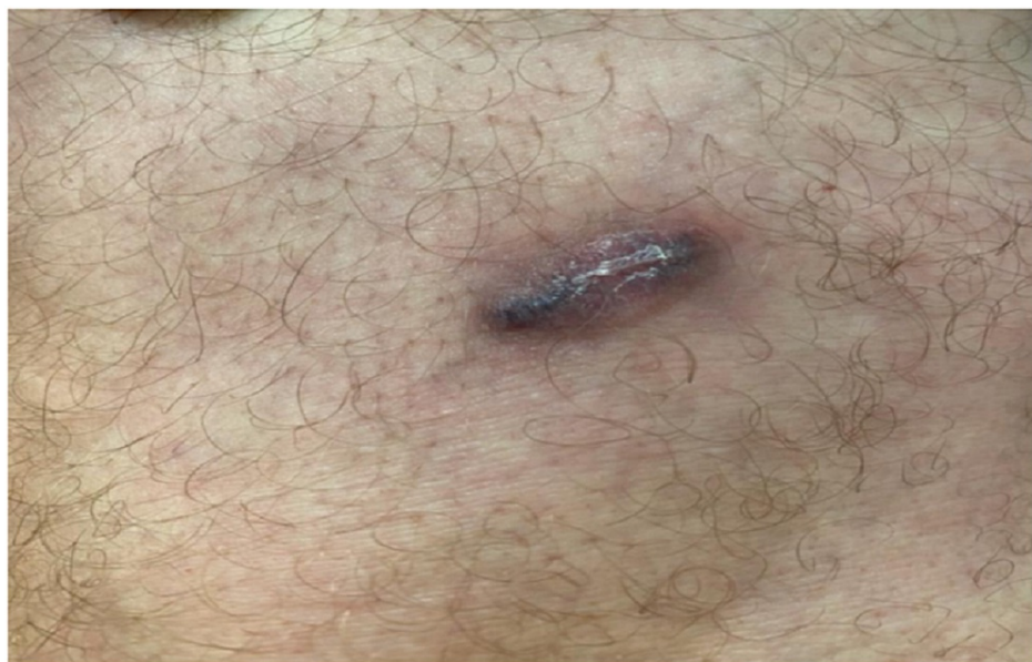
FIGURE 3: Picture of healing and improvement in the size of the skin lesion after four-month treatment with oral fluconazole

The differential diagnosis included both histoplasmosis and cryptococcosis. Histoplasmosis was prominently considered given the geographical epidemiology, and the Infectious Disease was consulted. Histoplasmosis serology and antigens were negative. Serum was also negative for cryptococcal antigens, and there was no evidence of disseminated fungal infection. Attempts at tissue culture were unsuccessful. The paraffin block was sent for fungal polymerase chain reaction (PCR) and was found to be positive for Cryptococcus neoformans . There were no clinical indications for a lumbar puncture given the indolent course and absence of neurological symptoms. The patient was started on oral fluconazole 600 mg twice a day for 14 days followed by 400 mg twice a day for four months. This resulted in significant rapid improvement within the first two weeks with complete healing of the skin lesion at the end of the four-month treatment (Figure 3).