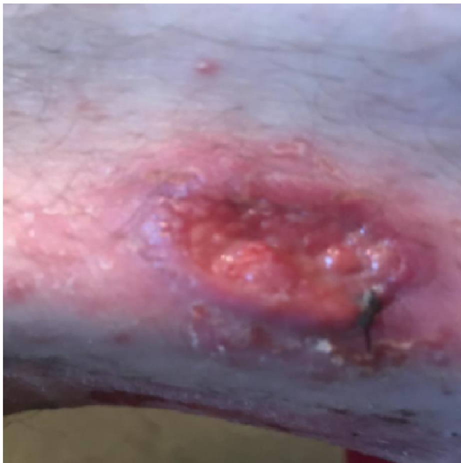
FIGURE 1: Picture of the skin lesion found on the left thigh on initial presentation

Laboratory results revealed a low lymphocyte count of 6.2%, but an unremarkable white cell count of 5.6 \times 10^9/L . HIV serology was negative. The absolute lymphocyte count was 0.3 \times 10^9/L . Punch biopsy of the skin lesion showed a deep fungal infection with numerous yeast forms predominantly within the cytoplasm of macrophages (Figure 2).