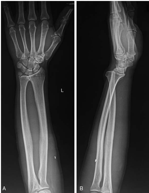
Figure 1. X-ray films of the foreign body. There was a 3-mm high-density shadow in the superficial soft tissue. Additionally, an old fracture of the left ulnar styloid process was found.

After preoperative preparation, the patient was placed under general anesthesia. A sterile tourniquet was placed for surgical treatment. Extending the left upper limb, the original wound was approximately 5 mm and was enlarged using a No 11 blade. The surgeons then probed the wound and traced the FB layer by layer.