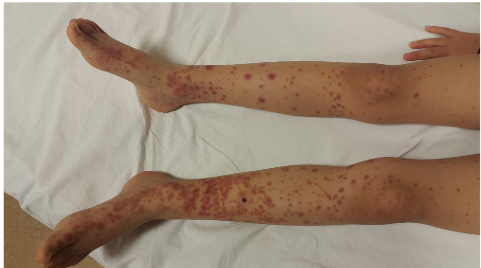
Fig. 1 Typical purpuric rash in legs of the patients

In the echocardiographic evaluation on the 15th day of treatment, the thrombus in the right atrium disappeared. On the 60th day, pericardial effusion disappeared, and heart functions were completely normal. In the sixth month of the treatment, myocardial inflammation, pericardial effusion, and thrombus appearance in the right atrium were observed to be completely improved by functional cardiac MR control. In the seventh month, anemia, hypoalbuminemia, kidney function, and acute phase reactants were normal. The patient's proteinuria decreased gradually, and at the final control in the eighth month, the value was 140 mg/day (7 mg/m 2 /h). The patient is still being followed up with azathioprine, low-dose oral prednisolone (5 mg/day), and ramipril.