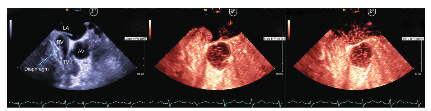
Fig. 2: Transesophageal echocardiography (TEE). Imaging demonstrated compression of the right atria by the diaphragm, in addition to a large atrial septal aneurysm and interatrial communication (left), with a positive bubble study (middle to right). LA, left atrium; AV, aortic valve/proximal aorta; TV, tricuspid valve; RA, right atrium ; RV, right ventricle